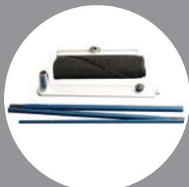
Folding design for a more compact, light weight unit.