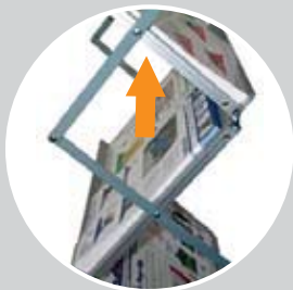
Double sided display with deep lip to hold more brochures