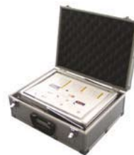
Scissor carry case (hard)