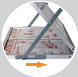
Safety locking mechanism