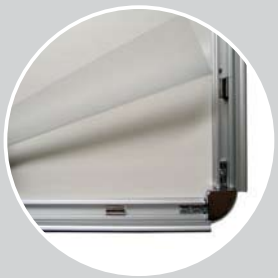
Non-reflective cover sheet included