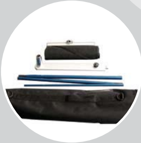
Light and durable aluminium structure