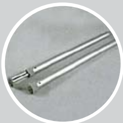
Three section telescopic poles for easy assembly.