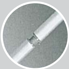
Slotted pin locked poles.