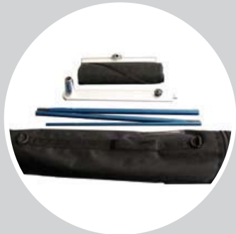
2-section Support poles